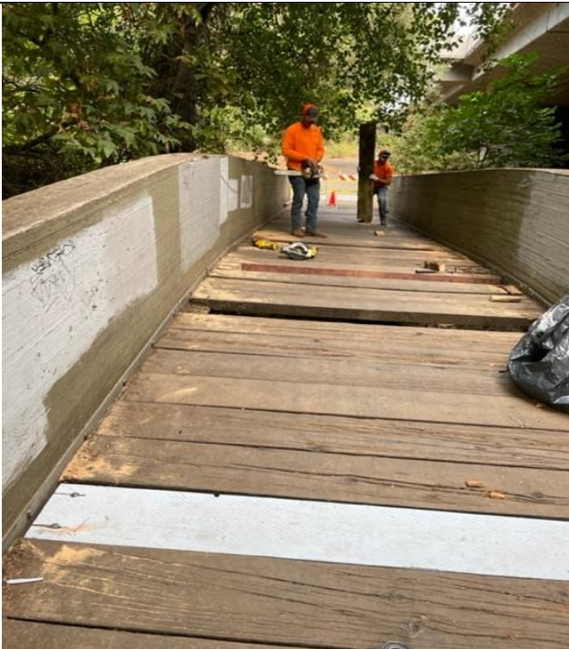
Figure 3-Footbridge Repairs