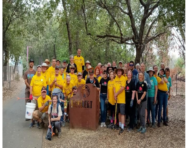
Figure 2 Faith Lutheran @Teichert Ponds