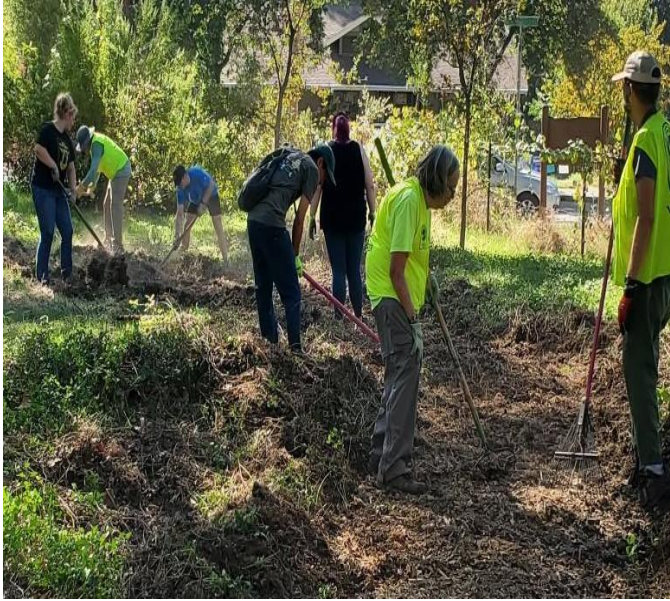
Figure 1 CAVE volunteer trail work