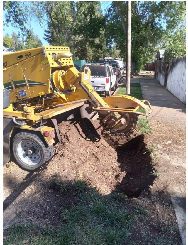
Figure 2 Contractor stump grinding operations.