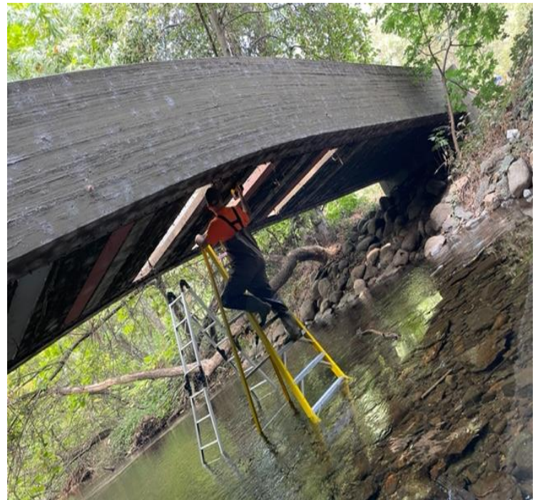
Figure 4-Footbridge Repairs