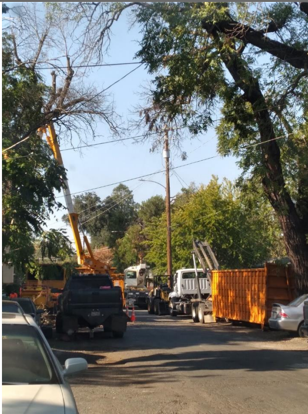
Figure 1 Contractor tree removal operations in progress.