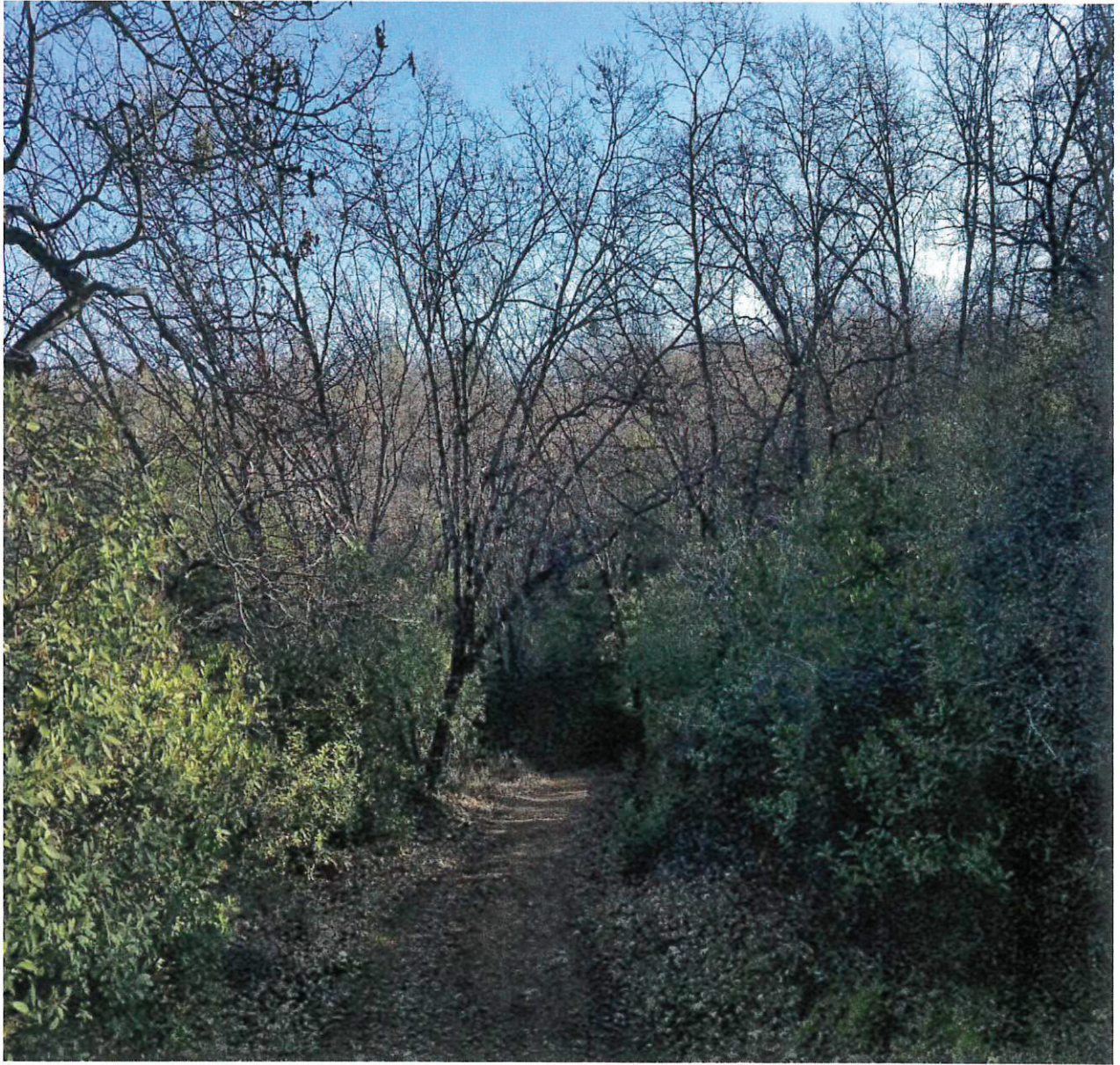
Figure 2 10 Mile House Rd at intersection with Guardian Trail GPS 39.80554983, -121.71707247