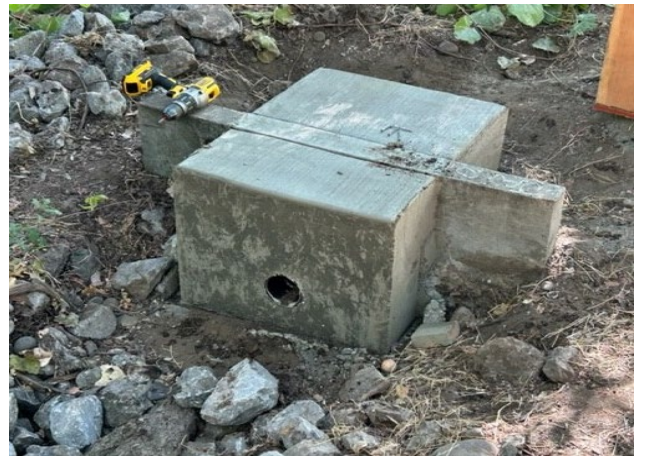
Figure 6- Annie's Tunnel Discharge Repair