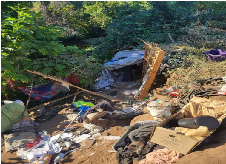
Figure 3 BCC Site 2 Before