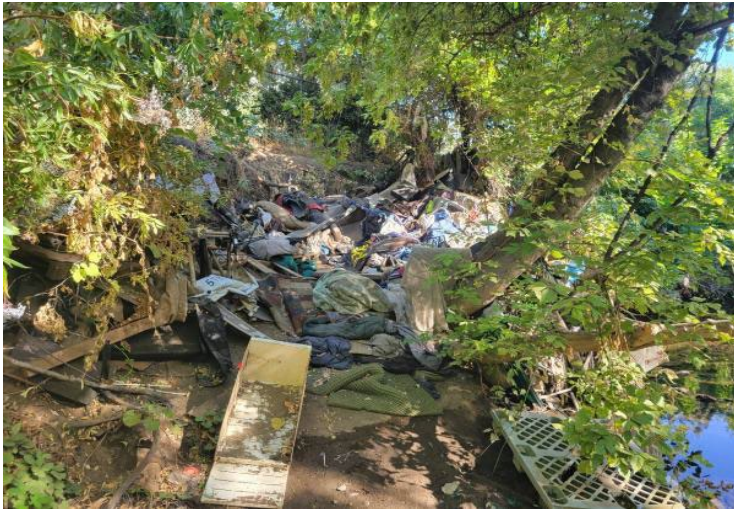
Figure 1 – BEC Cleanup Big Chico Creek Site 1 Before