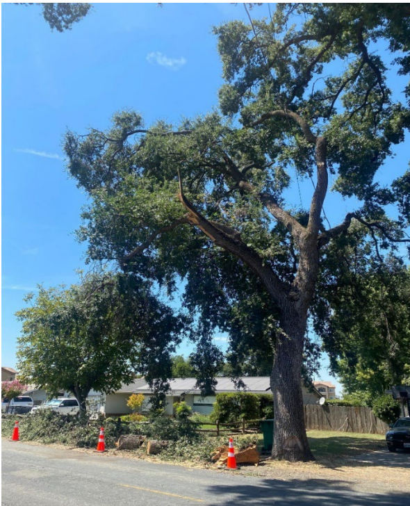
Figure 2: Tree limb cleanup on Nord highway.