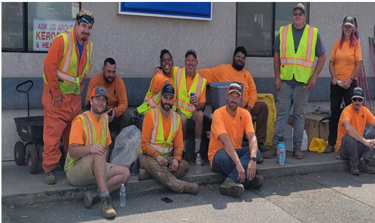
Figure 5 Happy and Tired Staff at BCC cleanup