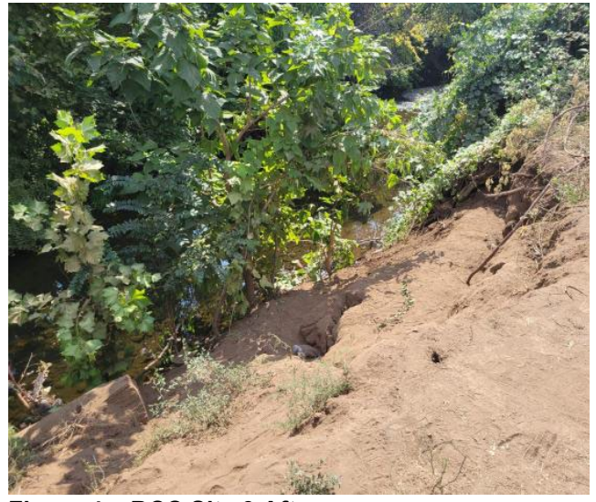
Figure 4 = BCC Site 3 After