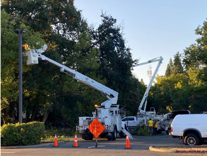
Figure 1: 901 Fir St. light pole clearance work.