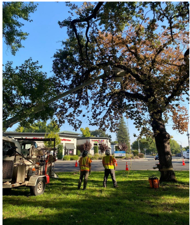
Figure 3: Vallombrosa @ Mangrove training day