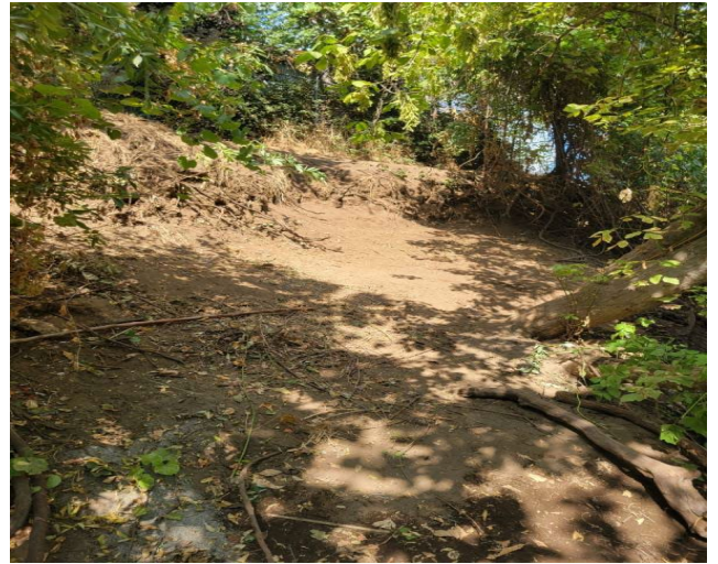
Figure 2 - BCC Site 1 After