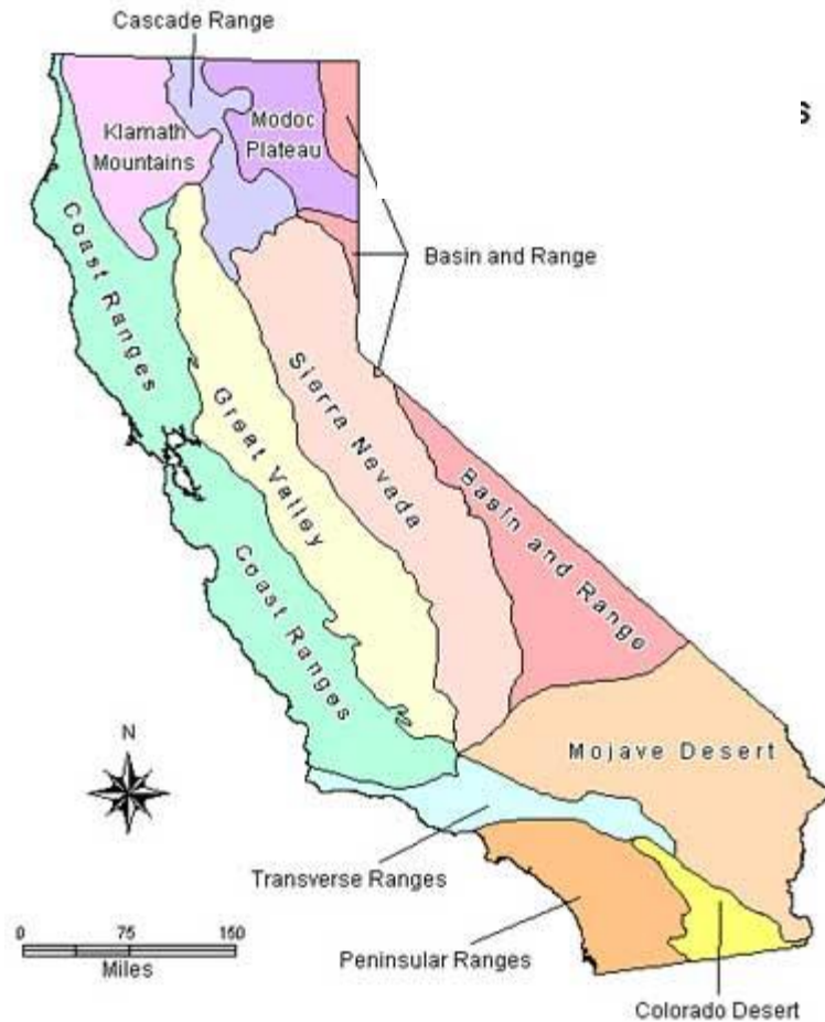
Figure 1. California Geomorphic Provinces

Alternatively, the Permittee may use a geomorphically based hydromodification standard or set of standards and analysis procedures designed to ensure that Regulated Projects do not cause a decrease in lateral (bank) and vertical (channel bed) stability in receiving stream channels. The alternative hydromodification standard or set of standards and analysis procedures must be reviewed and approved by the Regional Board Executive Officer.