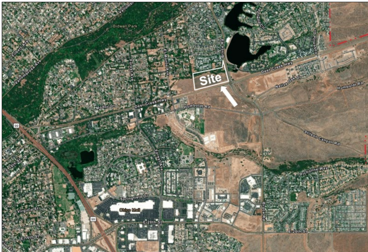
Figure 1 – Location Map