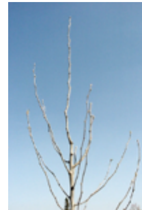
Topping and retaining a leader is desirable.