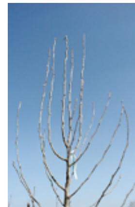
Topping without retaining a leader is not desirable.