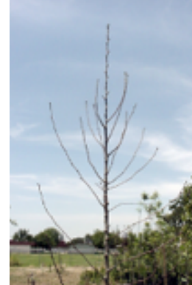
Not topping is desirable.