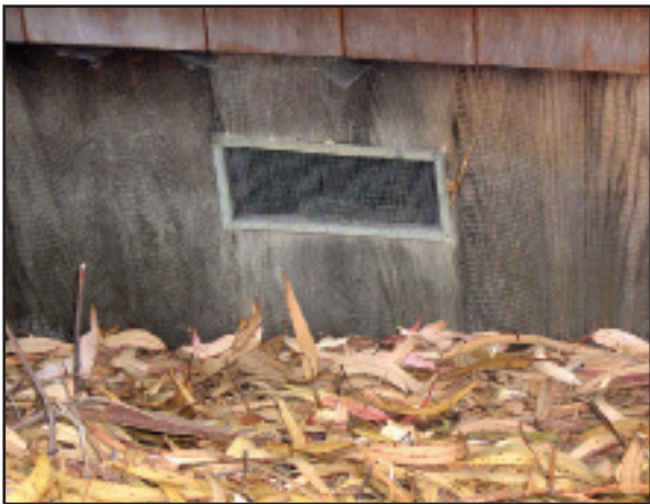
Combustible material like this mulch, near skirting or siding, leaves the home unprotected, even with screening in place.

There are several different types of vents for a home. These vents play a vital role by supplying openings for air to flow through. However, these vents can allow embers to enter a home during a wildfire.