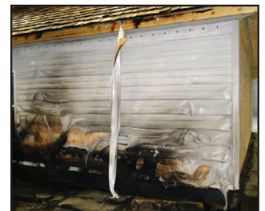
This vinyl gutter melted from heat, exposing the wood and roof edge to embers and direct flame.

Install gutter guards to keep debris from accumulating. Maintain the roof where the gutter connects to make sure debris does not accumulate between the guard and roof.