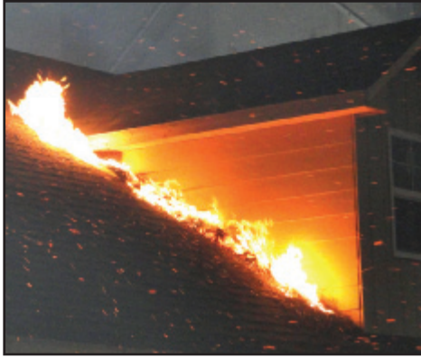
Leaves and needles burning along roof edge with dormer.