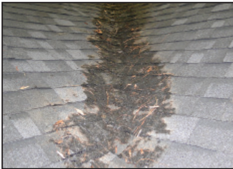
The pine needles on this roof burned, but the Class A roof did not.

The roof is one of the most vulnerable areas of a home. It is a large surface that is capable of catching embers during a wildfire. A roof also can collect dead vegetation such as pine needles and leaf litter, which will readily ignite. So the maintenance of a roof is as important as the materials used to construct it.