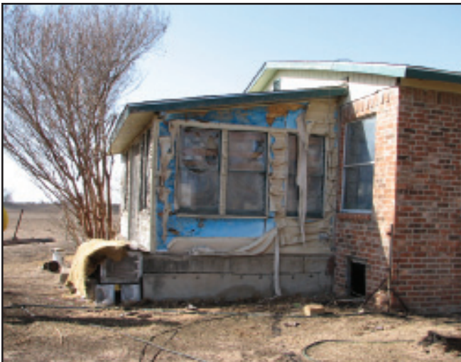
The vinyl siding and window frame on this home melted when exposed to radiant heat.

Use non-combustibile siding and make sure there are no crevices or holes that could potentially catch embers.