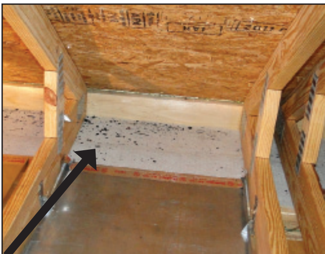
Without roof edge flashing, embers can enter into the attic. Photo by Institute for Business and Safety Research Center.

Box in eaves with non-combustible material.