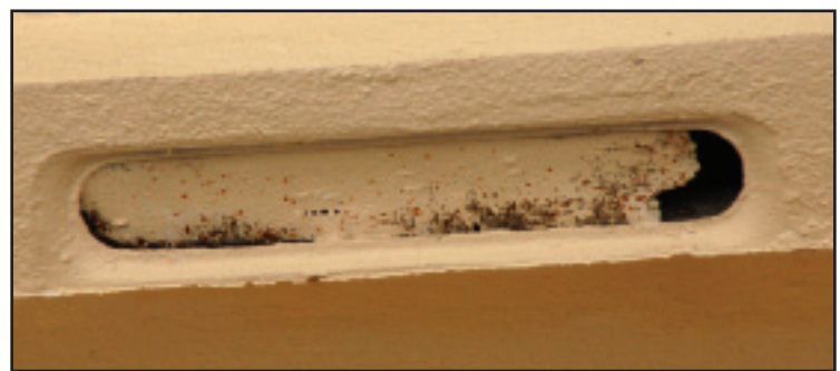
Vents can clog. This vent was painted over, reducing its effectiveness in providing ventilation.