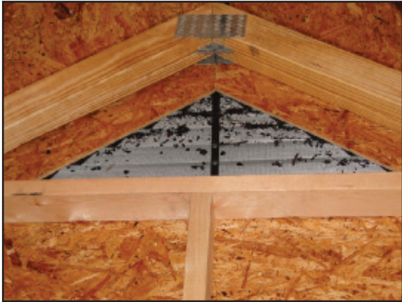
Screening helped capture these embers and prevent their entry into the attic.