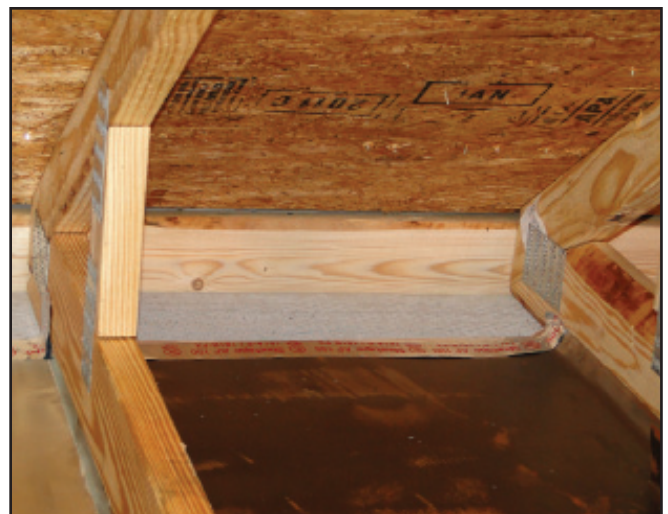
With roof edge flashing, fewer embers enter the attic area.